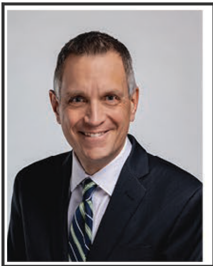
Mark Sutcliffe Mayor of Ottawa