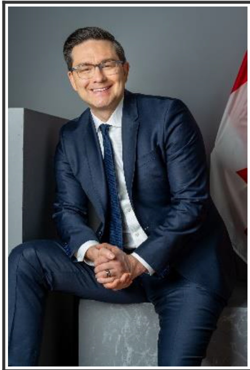
The Hon. Pierre Poilievre, P.C., M.P. Leader of His Majesty's Loyal Opposition and Leader of the Conservative Party of Canada

It's a pleasure to welcome everyone back to the Metcalfe Fair!